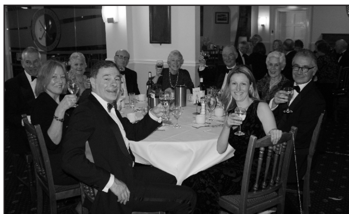
CHEERS! A good time was had by all at the St Mary's dinner and dance in January

Including the renewal of Baptismal Vows and the Easter Egg Treasure Hunt