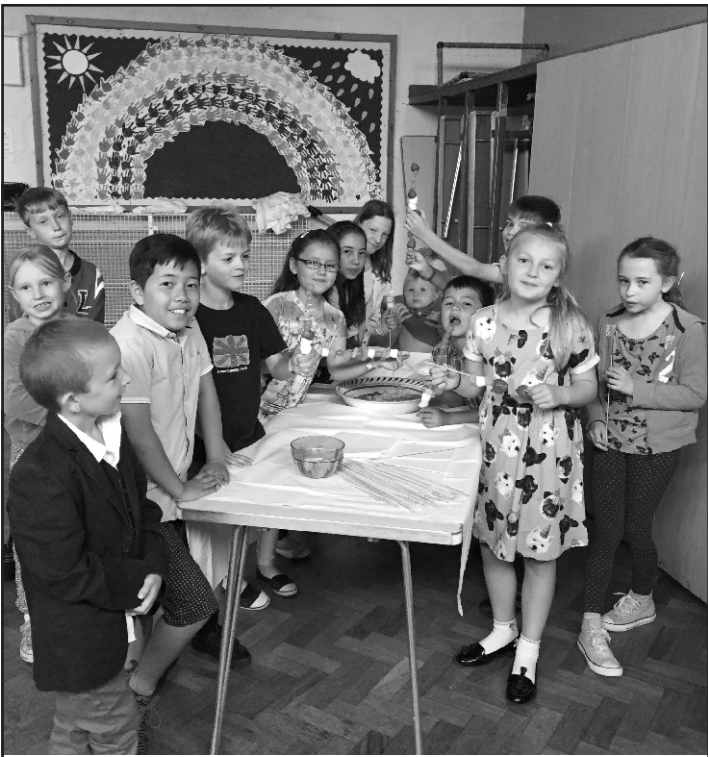
SUMMER FUN: Twenty one children ranging in ages from 17 months to 15 years enjoyed a morning together having fun at the Junior Church Summer Party. They enjoyed games and making, then eating, fruit kebabs.