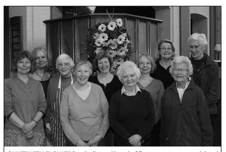
SAY IT WITH FLOWERS: a dedicated band of flower arrangers work hard to make the church look beautiful, especially on Easter Day.

If you are concerned about debt you can find information about help here: https://capuk.org