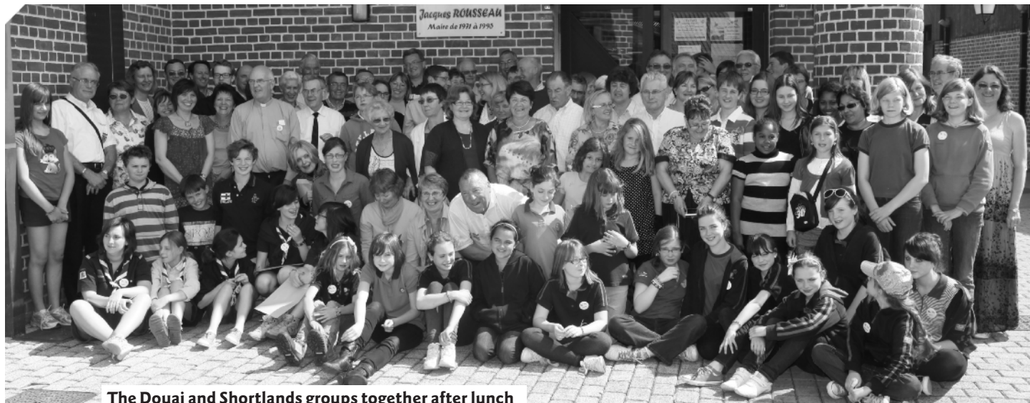
The Douai and Shortlands groups together after lunch

The annual exchange visit between Shortlands and Douai took place in early May when over 50 parishioners from Shortlands made the journey to Douai, Northern France.