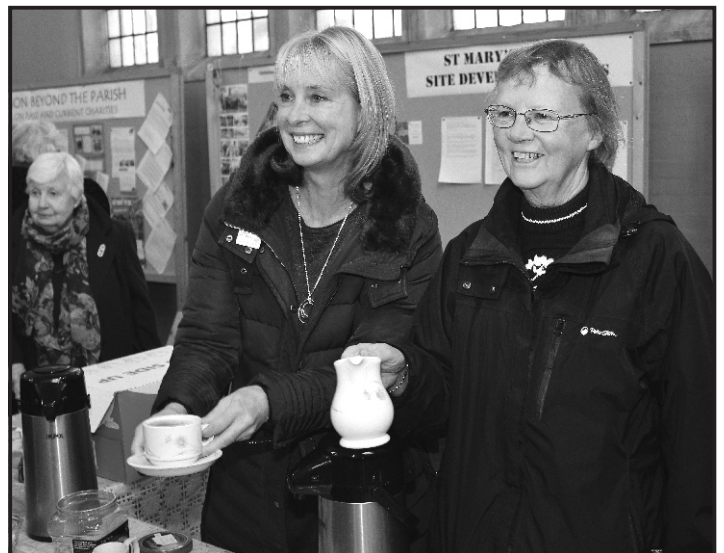
A WARM WELCOME awaits you from our 'baristas' serving coffee after 10.30am services at St Mary's