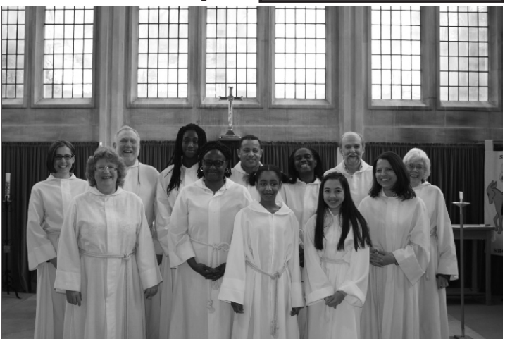
SERVING ST MARY'S: the 'servers' team supports the clergy to prepare for the service, and participates in it. New members of the team are always welcome- ask the parish office to find out more.