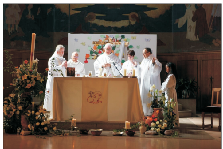
ENTENTE CORDIALE: St Mary's recently visited our twin parish in Douai, northern France, and shared in worship together (more details on page 3)

If you are a praying type, do pray for all the women and men of integrity.