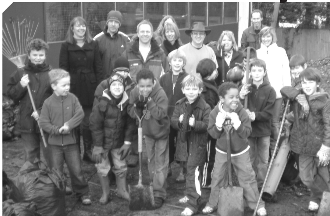
On a cold Saturday morning in January, two Cub packs had a 'leaf cleaning competition' to clear the mountains of leaves in St. Mary's grounds around the Scout Hut. They managed to fill over 100 sacks. Pictured are some of the 28 Cubs and their grown-up helpers!