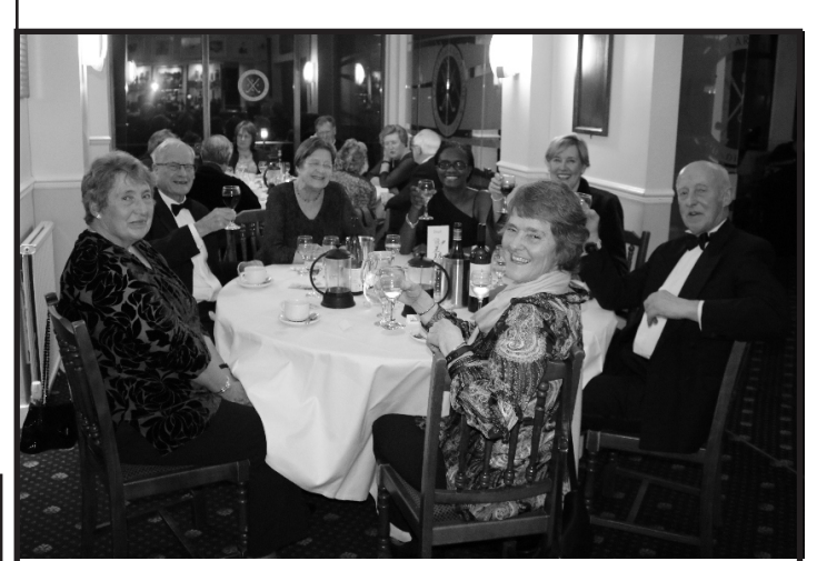
A NIGHT OUT: the Friends of St Mary's enjoyed a dinner dance at Langley Park golf club in January.

Buddhists may celebrate Nirvana Day by meditating or by going to Buddhist temples or monasteries. As with other Buddhist festivals, celebrations vary throughout the world. In monasteries Nirvana Day is