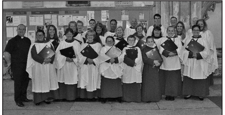
St Mary's choir has been on tour again - this time at Rochester Cathedral in August

For 30 years, MAG has helped over 18 million people in 68 countries rebuild their lives and livelihoods after war. For more information visit www.maginternational.org or see the board at the back of church.