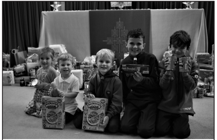
Gifts generously donated at Harvest Festival were passed to Bromley Women's Aid

For more information, visit www.whiteribbon.org.uk or for emergency support contact: Rape Crisis: 0808 802 9999; Men's Advice Line: 0808 801 0327; Galop - LGBT+: 0800 999 5428; Women's Aid: 0808 2000 247.