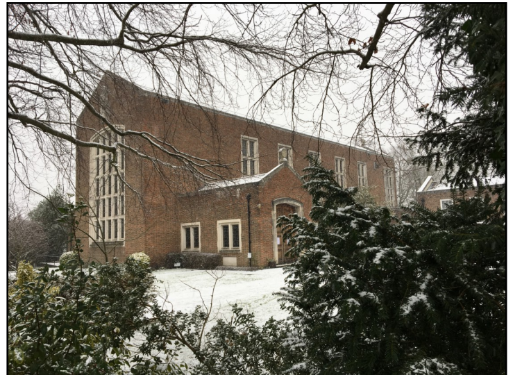
A WINTRY SCENE: St Mary's was briefly dusted with snow last month

We can talk with real pride about the past twelve months and how we have embraced love in our support of others during incredibly challenging times, but it is now and going forward in our lives that love is even more important, a virtue that should continue to be at the heart of all we do within our community.