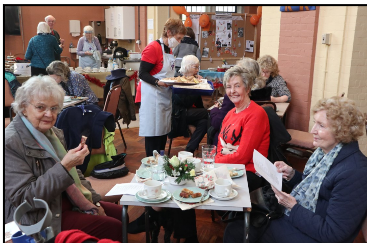
The Community Café offered a warm welcome to 'Betwixt' on the Wednesday between Christmas and New Year