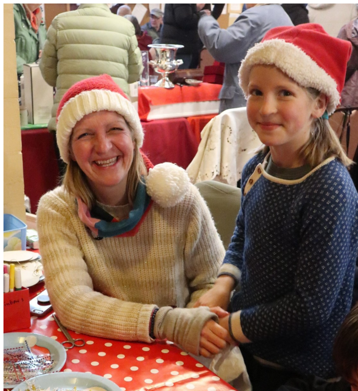
ALL THE FUN OF THE FAIR: St Mary's Christmas Fair was jam-packed with Christmas bargains and fun.

In 2022 St. Barnabas was merged back with St. George's to become a combined benefice.