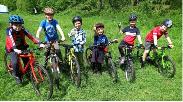
Cubs have fun!

Recently, 7<sup>th</sup> Bromley, Mowgli Cub Pack entered a team into the Cyclo Cross competition. See page 2.