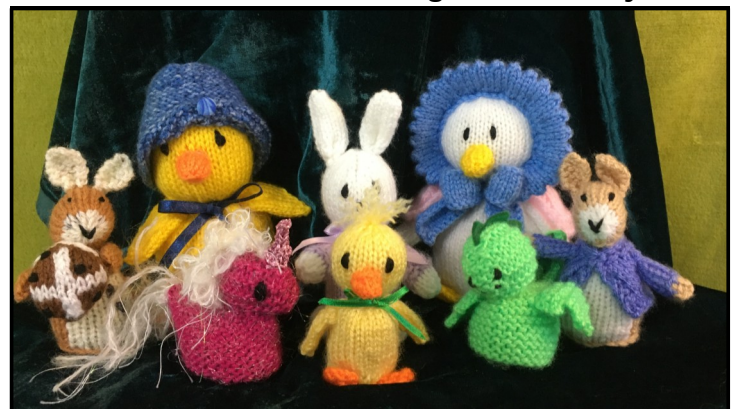
St Mary's Craft and Chatter group have produced an array of Easter goodies – for sale via office@stmaryshortlands.church .