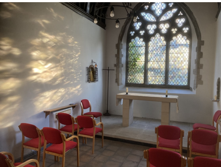
PICTURED: St Augustine's College of Theology, West Malling