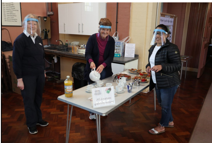
St Mary's baristas were practising their skills at the recent plant sale