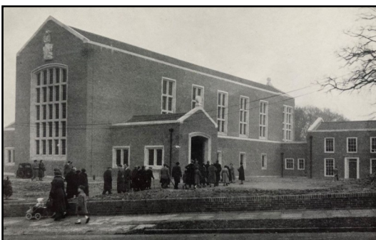
MEMORIES: see page 2 for more news of St Mary's history