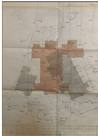
PICTURED: a plan showing the position of the new church in relation to the old church and its vicarage

We look forward to welcoming you again for the anniversary of the consecration of the new church in 2025!