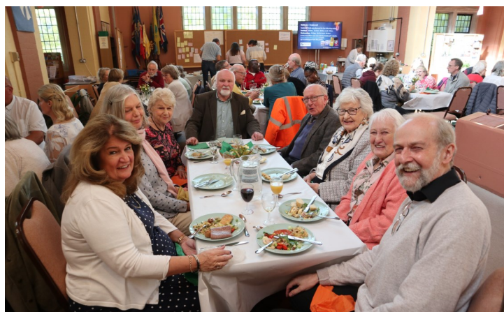
Over 70 members of the congregation and wider community enjoyed the Harvest Lunch in the Church on Sunday 9th October.